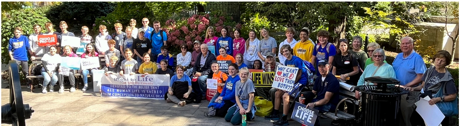
Pictured: Pro-lifers who rode the Shelby County Right to Life bus to Columbus (above); members who traveled separately (right); University students heading the procession (below).